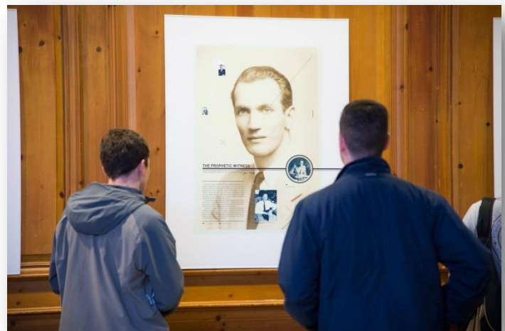
Students admire one section of the exhibit at the opening reception